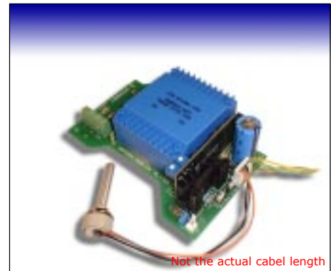
400SCB/424 Speed Control Board with remote potentiometer (10Kohm)